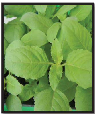
Figure 1: Ocimum sanctum leaves.

Phytochemical analysis of aqueous extract of ocimum sanctum - The aqueous extract of ocimum sanctum was subjected to phytochemical analysis find out the presence and