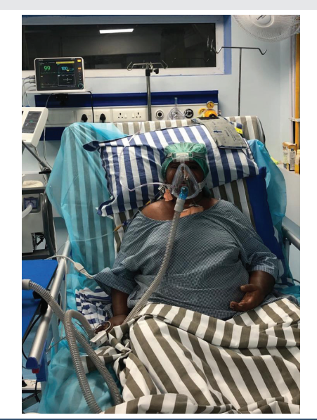
Figure 1: Patients receiving Non-Invasive Ventilation on the third day after extubation.

For the continuous sampling of arterial blood gas, we had an arterial line monitor, and a central line for fluid and electrolyte balance in the intensive care setup. Lung function tests and flow volume loops have been used, although their usefulness in the diagnosis of mediastinal tumors is questionable. Flow volume loops have been indicated during thoracic surgeries. Also, with their alleged ability to assess the degree of impairment and distinguish between extra-thoracic and intrathoracic blockage, investigations have demonstrated that they correlate poorly with the degree of airway obstruction and do not alter the anesthetic technique.