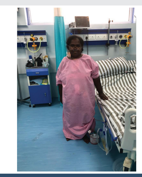
Figure 3: The patient mobilized after 9 days with 2Litres of oxygen in nasal prongs.

Citation: Krishna Prasad T, Kayal AK, Adhithya K, Sankar B (2024) Scope of a short & obese patient for thymoma surgery with the risk of difficulty in weaning from general anaesthesia. Open Journal of Chemistry 10(1): 020-023. DOI: https://dx.doi.org/10.17352/ojc.000035